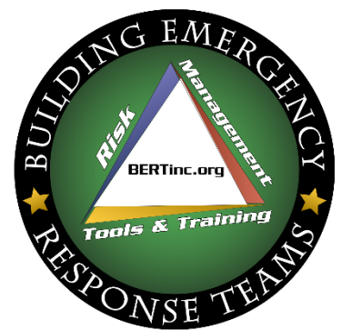
B.E.R.T. Building Emergency Response Teams